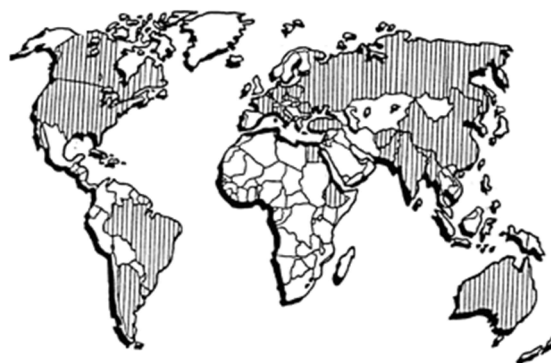
Figure 1 Flax-growing countries (hatched)

Analysis of the global oilseed flax production shows that the leading producers of oilseed flax in the world are Canada, China, India, Argentina, USA and Russia. The total gross seed yield in these countries makes 1.2 million tons. In Ukraine this crop has not been paid attention over many past years due to social and political processes occurring in our country in the course of centuries. Nowadays oilseed flax returns to Ukraine. A wide range of varieties, their diversity and high profitability contribute to rapid spreading and annual growth of sown areas for this crop cultivation.